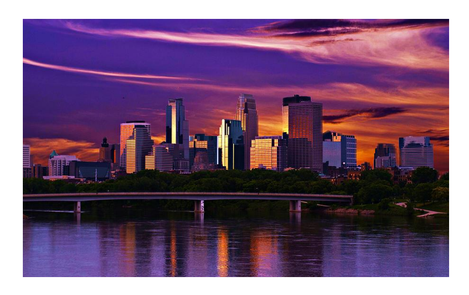
May 16-17, 2019

Marriott Minneapolis West – St. Louis Park, MN